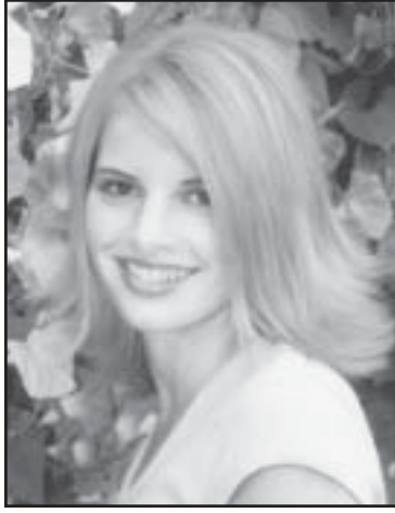
Patricia Hagman Jack and Wanda Mechsner Scholarship