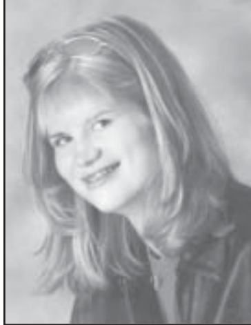
Anna Berry J. Byrum Scholarship Patricia J. Eicher-Butler Scholarship