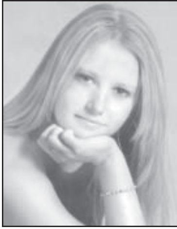
Elise Engelbert Jack and Wanda Mechsner Scholarship Ida Tansill Scholarship