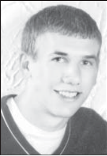
C.J. Thiele J. Byrum Scholarship Jack and Wanda Mechsner Scholarship