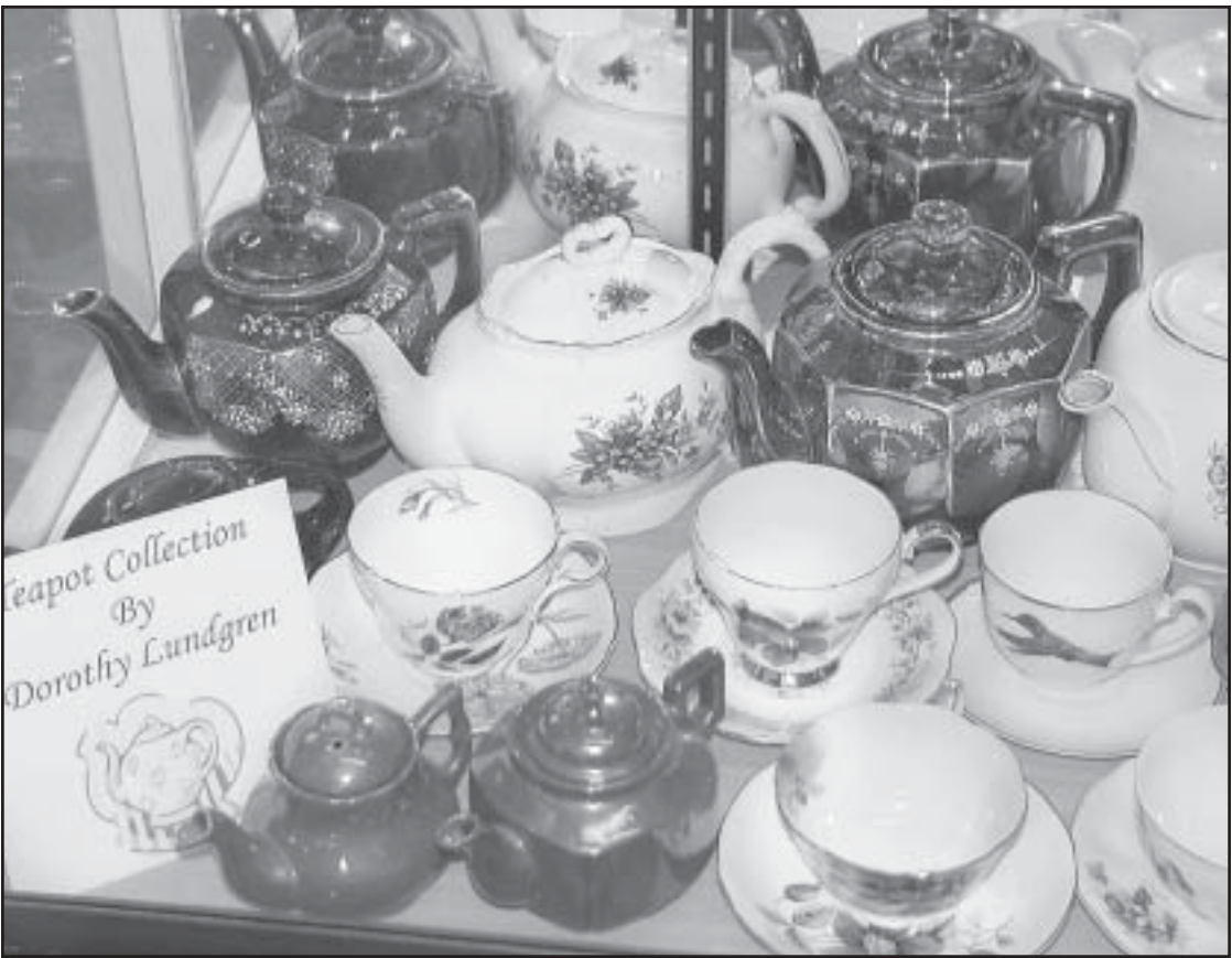
DorothyLundgren's teapot collection

As a teapot collector of many years, she has an exhibit that runs the gamut of this popular collectible. Although many of the larger pots were, no doubt, designed to be used in a drawing room for a formal tea, there are also many plump little brown kitchen teapots and bright, perky individual pots that brew just one cup. Cups and saucers decorated with flower motifs bring spring to mind with every sip. Over in the corner, miniature tea cups and plates need only a couple of