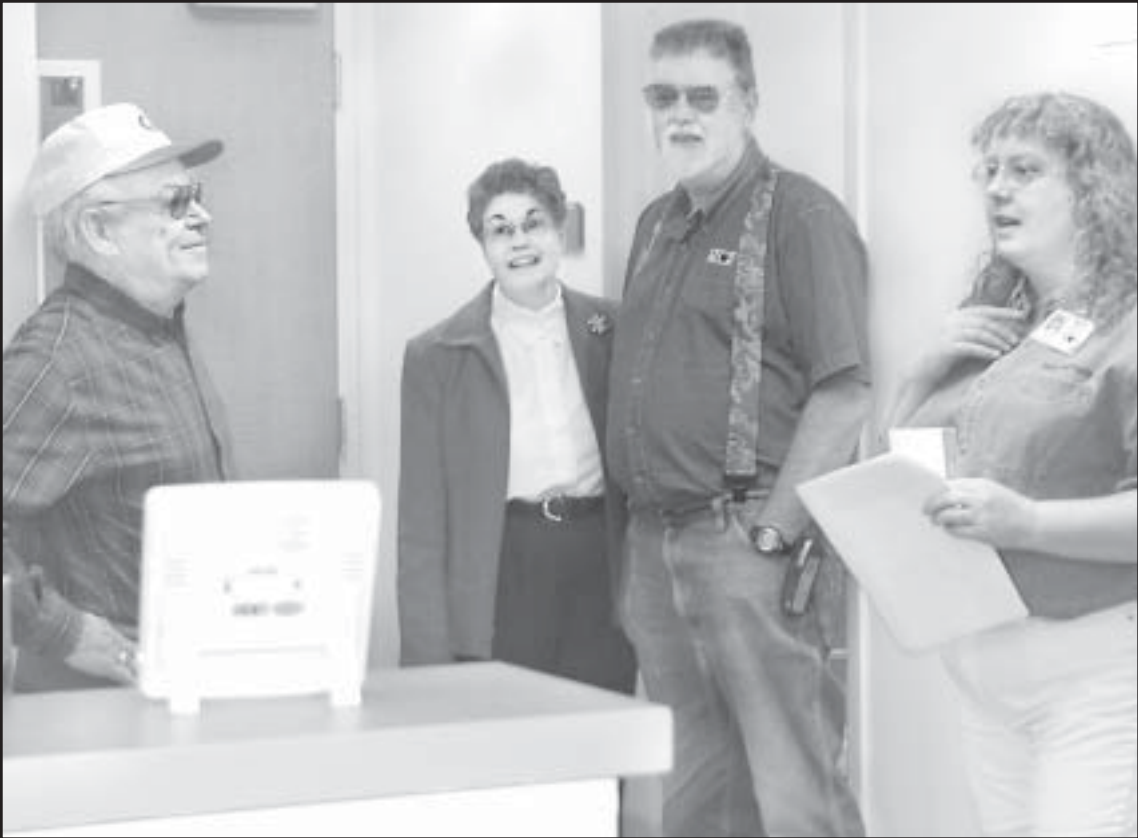
The new laboratory was just one of the places visitors got a chance to see on the guided tours of the newly renovated Norton County Hospital Sunday afternoon following the dedication ceremony commemorating the completion of the 22 month project.