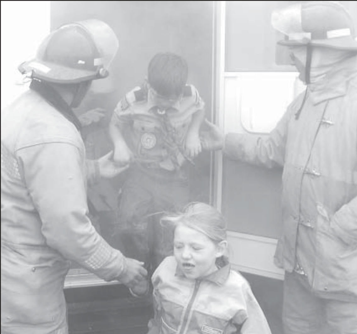
When they weren't racing cars (below), Cub Scouts from around the area as well as their families, got to crawl through a smoky trailer (above) learning what to do in a fire emergency at this year's District Pinewood Derby at the Norton American Legion.