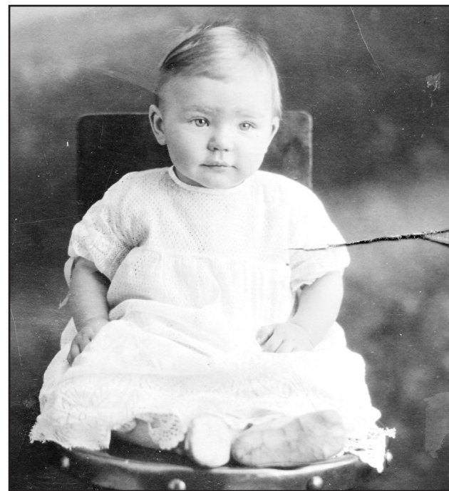
THE THRESHER QUEEN in her younger days.