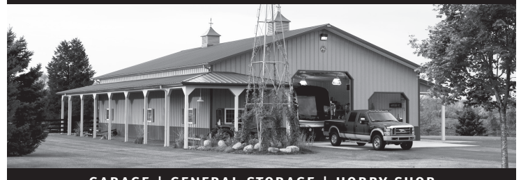
GARAGE | GENERAL STORAGE | HOBBY SHOP