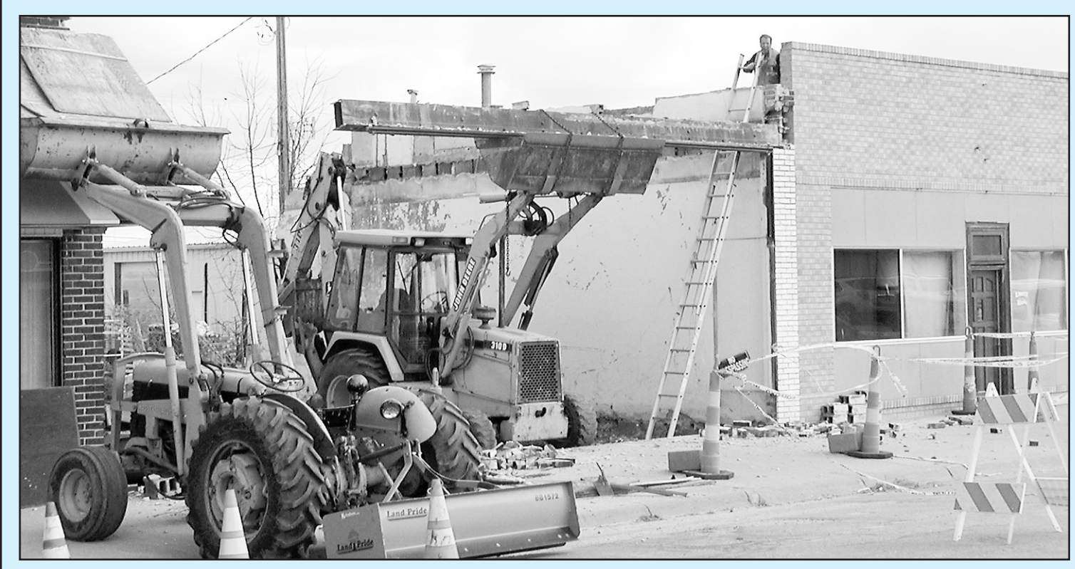
FINAL PIECES of the old theater building came down as Roy Shrader looks on.