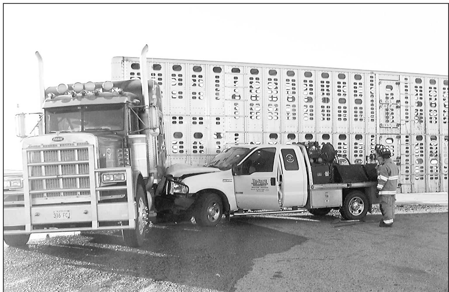
EMERGENCY RESPONDERS were called to a two-vehicle accident on U.S. 36 at Wheeler. A pickup ran into a semi truck that was turning left into the Captain Hook parking lot. There were no serious injuries.

The pickup belonged to Kelly Lampe. Zeitler, who was not wearing a seat belt, was taken to the hospital and later flown out for additional medical care.