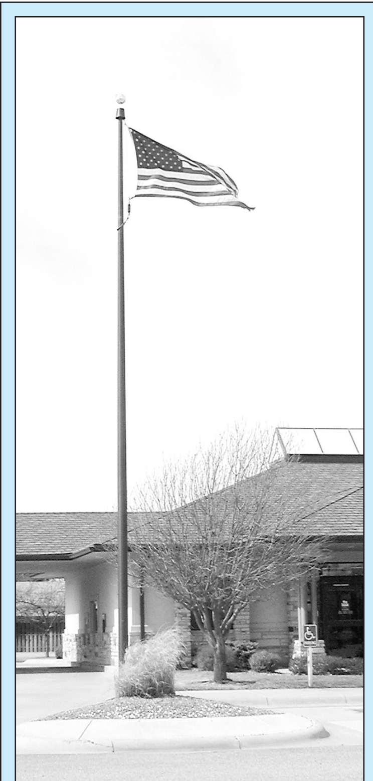
WINDY CONDITIONS returned to Bird City on Tuesday. After warmer weather conditions brought many outdoors, Mother Nature surprised us with cold wind gusts Tuesday afternoon.