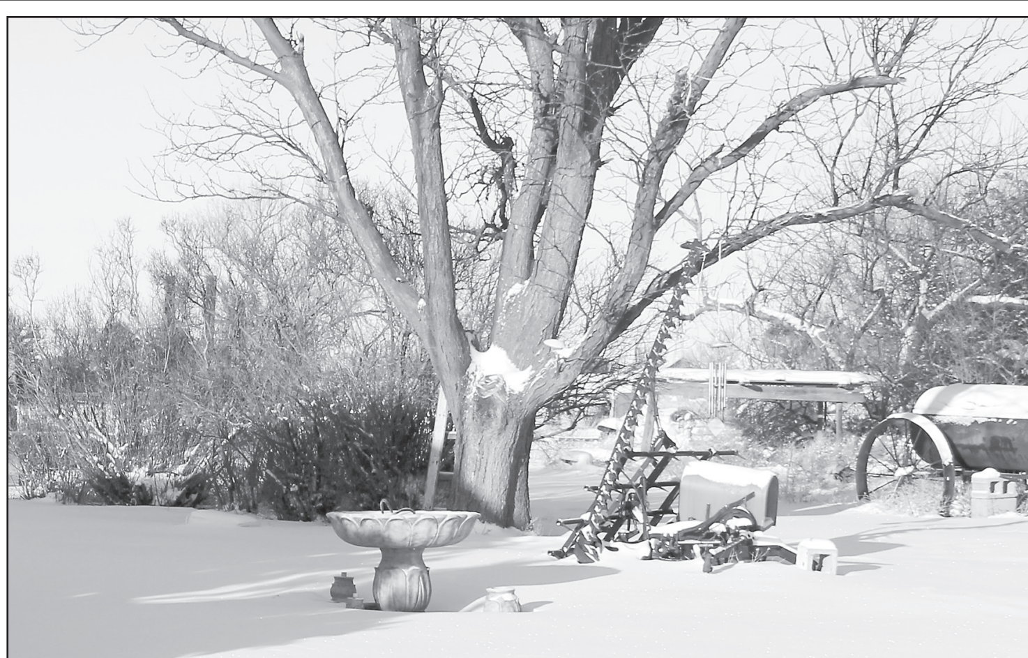
BIRD CITY received a beautiful blanket of snow over the last few weeks.