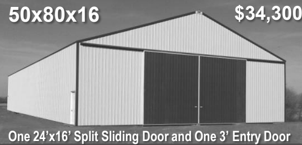
50x80x16 $34,300 One 24'x16' Split Sliding Door and One 3' Entry Door Price Includes DELIVERY & INSTALLATION On Your Level Site. Travel Charges May Apply