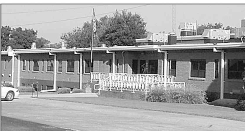
Cheyenne County Hospital