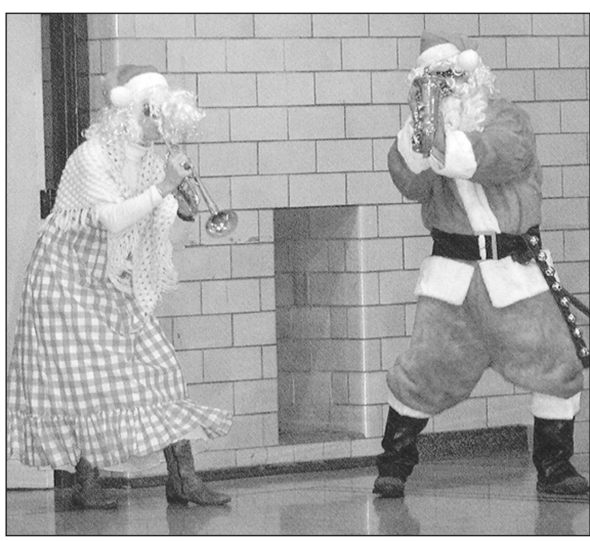
MRS. CLAUS AND SANTA are clowning around, playing their horns, as they enter the pep rally.