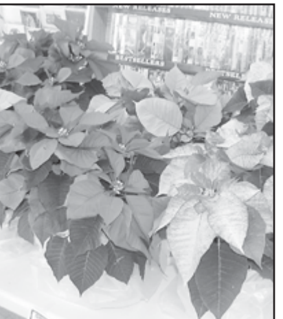
Poinsettia Plants $7.49

9. Winners agree to be photographed and interviewed by The Saint Francis