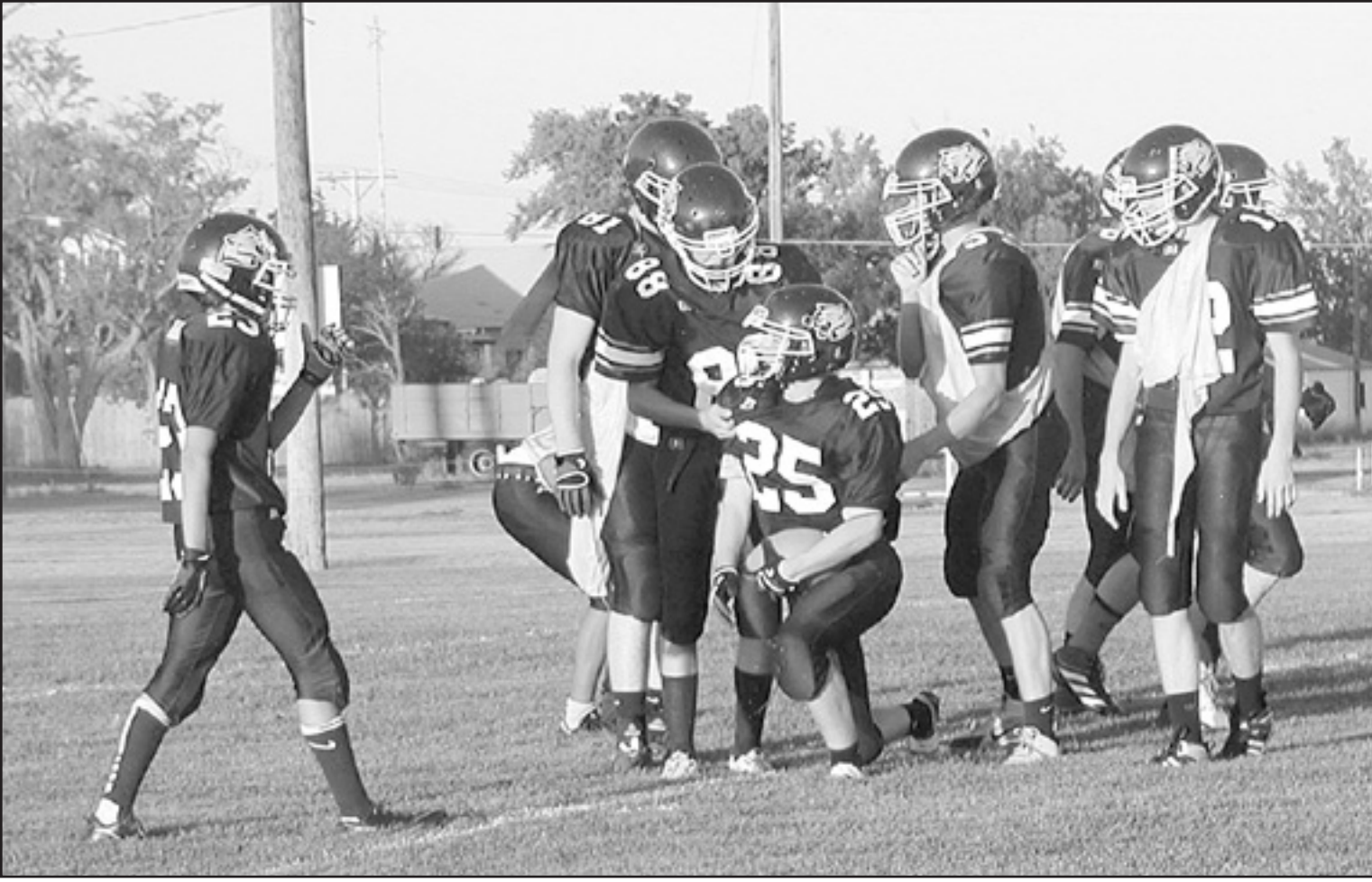
FOOTBALL players have a scrimmage to kick off the new season.

Yost's staff will be on site to assist with all vehicles and provide additional information about each vehicle available for test drive.