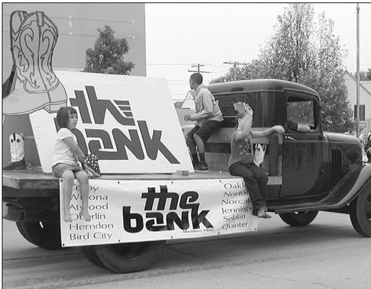
THE BANK had their sign attached to the old flatbed truck.