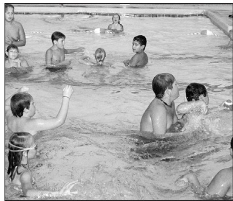
BASEBALL TEAM ends season with a party at the pool.