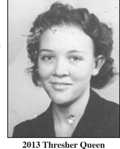
2013 Thresher Queen

cooking chores. The queen became a grain truck driver during harvest as well as driving the tractor during tilling and planting times. She also gained crop irrigation knowledge.