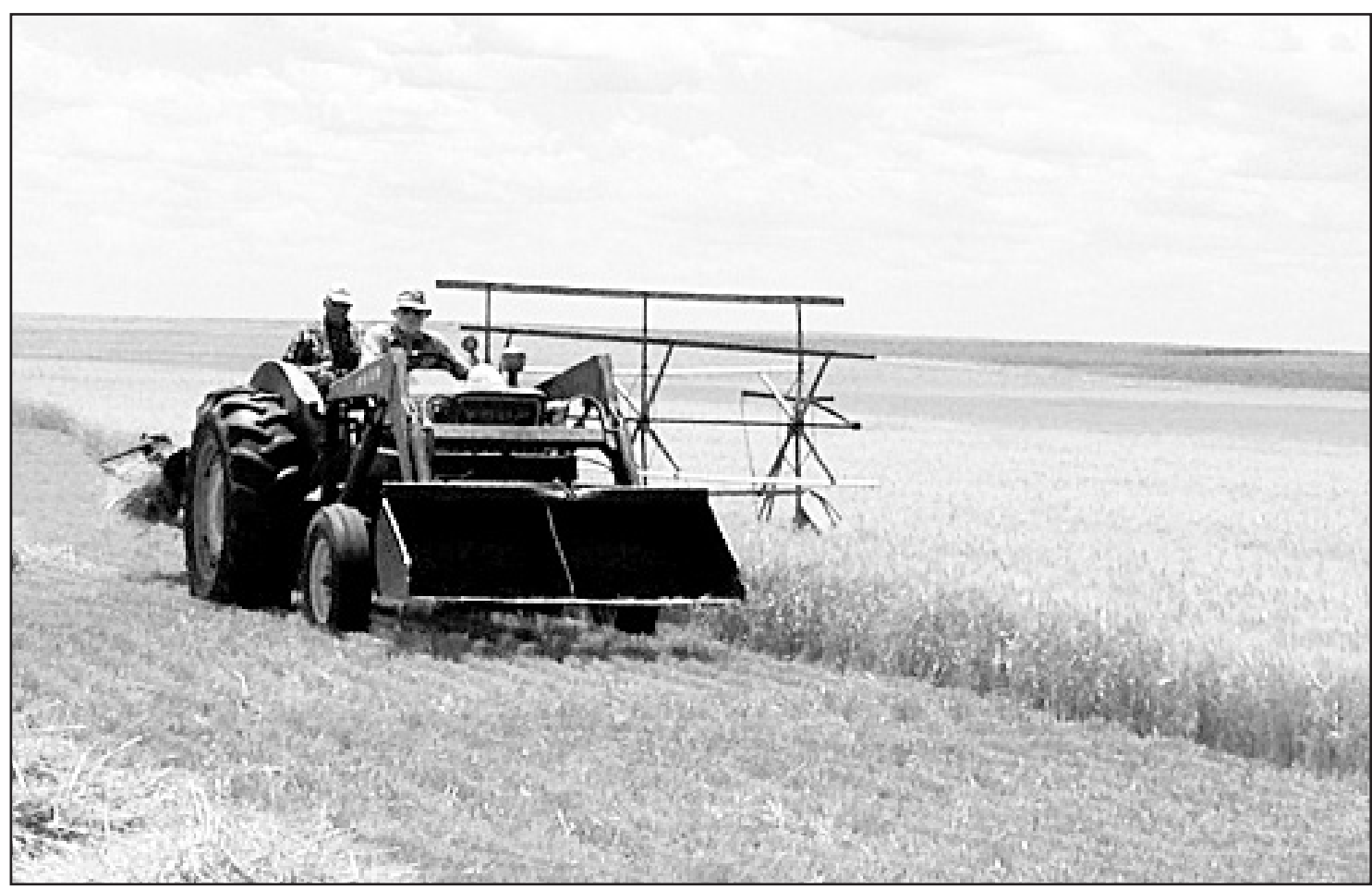
NORM DORSCH AND KEN BEOUGHER harvest and bind the bundles of wheat which will be used in the antique thresher machine at the Tri-State Antique Engine and Thresher show, July 25-27, east of Bird City.

Next meeting The next board meeting will be