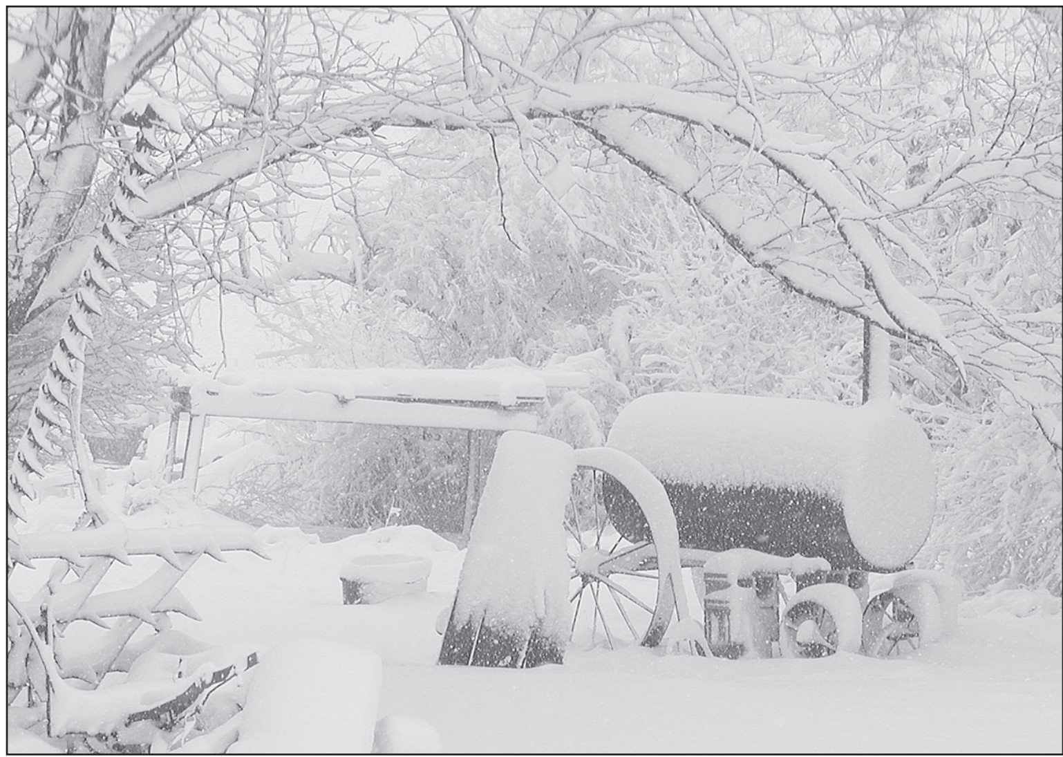
LAST WEEK'S SNOW was a beautiful in the country. Despite the wind, there were piles of snow on almost everything including trees and electrical lines.

The polls will be open from 7 a.m. to 7 p.m. on Tuesday. In St. Francis, voters will cast their ballot at the Peace Lutheran Church. In Bird City, the polling place is the Immanuel Methodist Church.