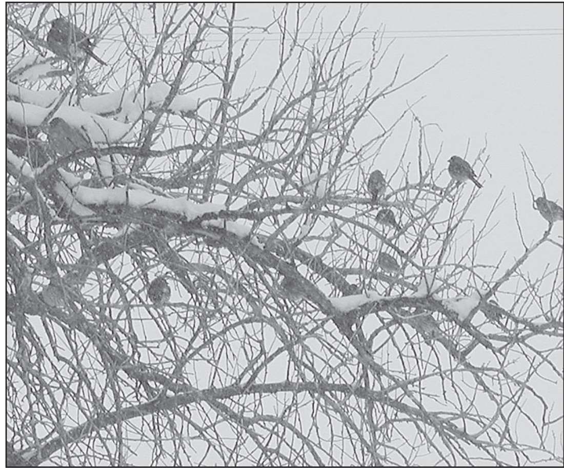
SNOWBIRDS flocked back and forth in the trees and snow chirping and playing as children would in their first time in snow.

Sunday church services were canceled on the 10th and 24th because of the blizzard conditions that closed U.S. 36