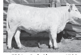
Z236 • Raile Bluegrass X195 X Super Charlie 0767