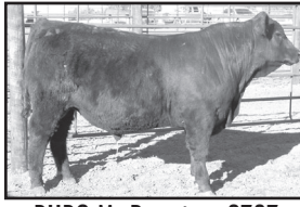
RHRC Mr Premium 278Z