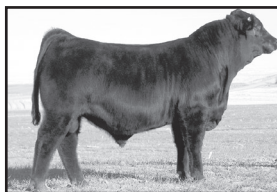
DMRS The Factor 297Z