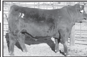
DMRS Mr Total 2125Z