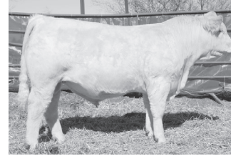
Z050 • Raile X150 X Primecut 0107

These bulls will increase length, muscle, improve yield grade and marbling while increasing efficiency in the feed yard and cow herd