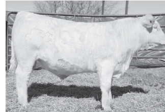
Z053 • Raile X150 X Finks 2250