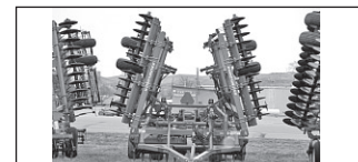
SUNFLOWER 6333-25' FINISHER Great Shape