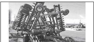
LANDOLL 7430-26' VT