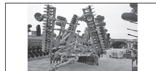
SUNFLOWER 6630-32' VT Low Acre VT, Great Shape