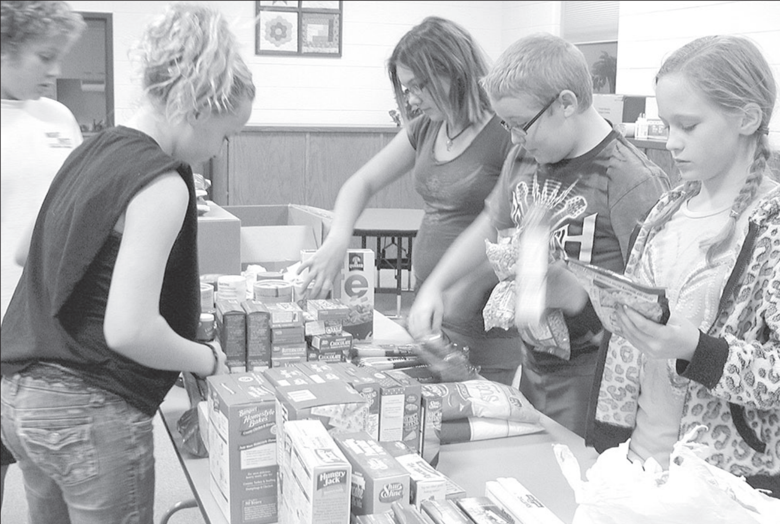
TEENS sort through food gathered during the drive held in Bird City.