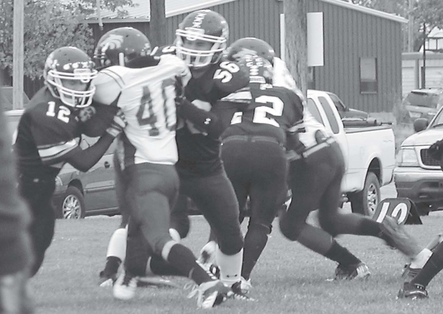
COUGAR BLOCKERS double team a Weskan Coyote in last Friday's game. The team lost two players to injury and lost the game