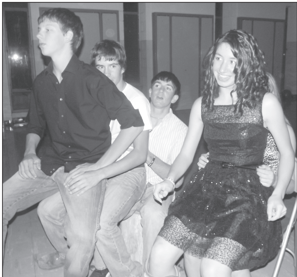
KIDS PLAYED fun games at the homecoming dance on Saturday night.