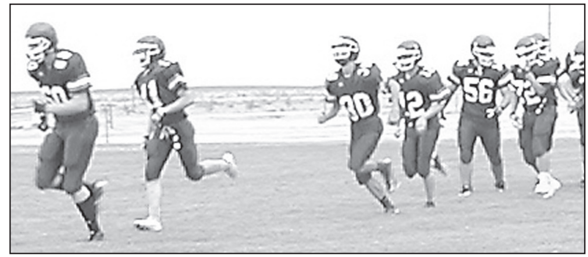
MEMBERS OF the Cheylin Cougars football team run onto the field in last Friday's open house.

Check next week's paper for coverage of the girls volleyball quad at Grinnell and don't forget to head out to Cougar Field Friday night to watch the Cougar football team open their season