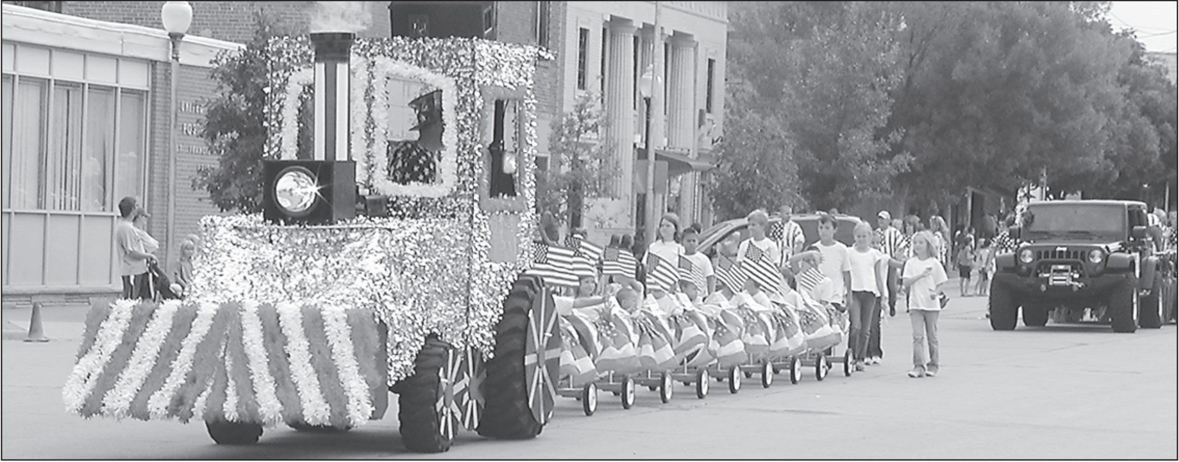
LIVING WATER Fellowship Church takes first place in the organization/church division at the parade held on Saturday.