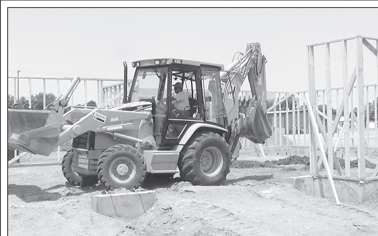
The ground was broken on May 25, for the two double apartment units to be constructed for the new Senior Housing Duplex Development. Paxton Building Services from Goodland is shown doing the dirt work.

• Enter your house number and password, select submit, and there will be a drop down list of addresses that you are able to choose from.