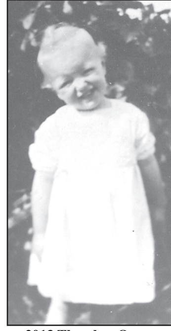
2013 Thresher Queen

The 59th Tri-State Antique Engine and Thresher Show will be held July 26 through 28 at the thresher show grounds east of Bird City. The Thresher Queen