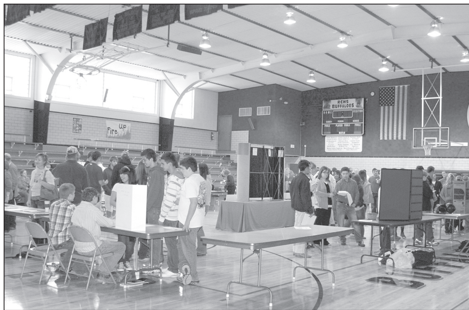
CHEYLIN STUDENTS participate in the Rawlins County Home Town Competitiveness Youth Entrepreneurship Fair held on April 5 at Rawlins County High School,

Next meeting The next commissioners' meeting will be held at 8 a.m. on Monday, April 30, in the commissioners' room in the courthouse.