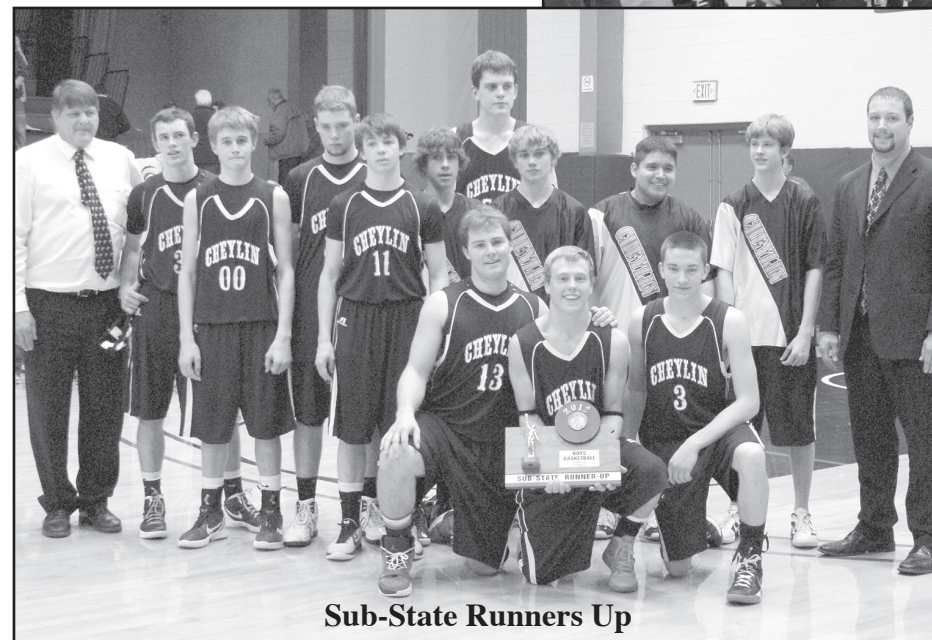
Sub-State Runners Up