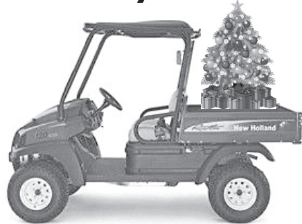
New Holland Rustler 125

She'll be anxious to use it to Fix Fence!! She can also use it to get the mail!