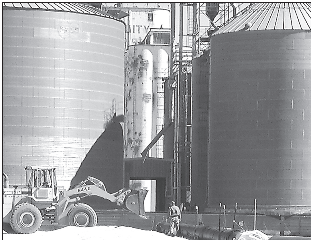
GETTING READY to store crops on the ground. Frontier Ag employees prepare the bunker to receive corn.