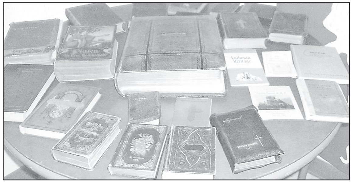
VARIOUS BIBLES were displayed during the celebration. The oldest Bible is in the center and belonged to Paul Roesener's parents. It is printed in German.

Burial was in the Bird City Cemetery, Bird City.