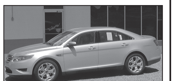
2011 Ford Taurus SEL, Ingot Silver, nicely equipped for $33,145, three to chose from, stock #85233