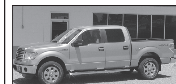
2011 Ford F-150 ECOBOOST XLT, twin turbo, 365 hp V-6, for under $40,000, stock # T5584