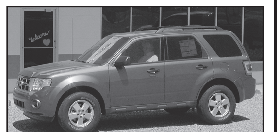
2012 Ford Escape XLT, AWD, Steel Blue Metallic, Sunroof and Tune pkg., $29,730, stock #T4630