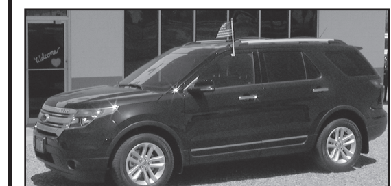
2011 Ford Explorer XLT, FWD, Kona Blue, cloth interior, for $35,370, stock #T3476