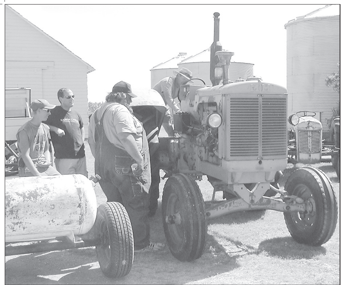
THE FARM MACHINERY drew interest from many people at the Roesener sale on July 19. One of the tractors is being inspected here.