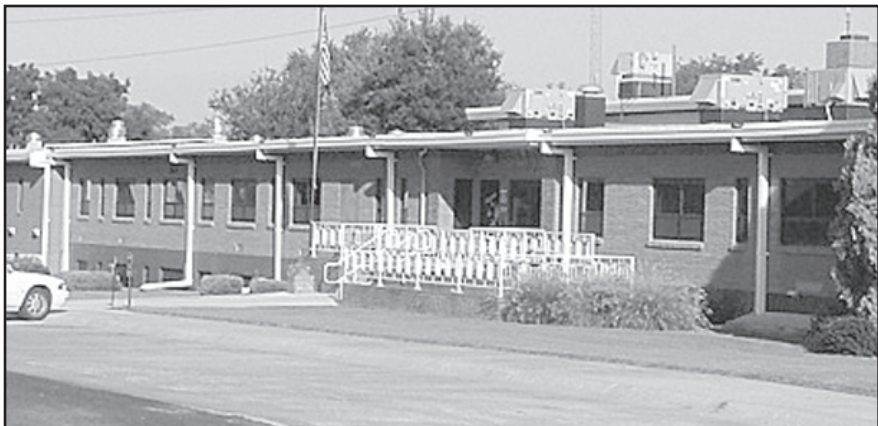
Cheyenne County Hospital