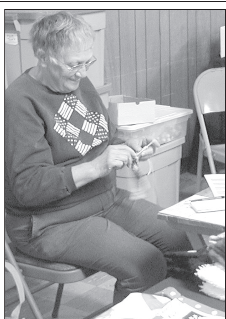
ONE OF THE VENDORS at last Saturday's craft show keeps busy making more items. The organizers were happy with the big turnout.

Auxiliary and the Local 4-H try to make sure the dignity of veterans is maintained while the help they need is supplied. In the spirit of the great mission of "Service Not Self" do something extra this year...start a new family tradition and make the military a part of your holiday by a material or cash gift that you would give one of your family members so that they will in gratitude say "thanks for remembering us". People can do no less.