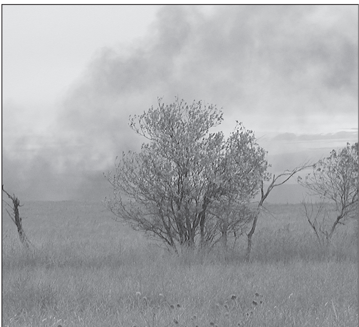
SMOKE FILLS THE SKY as the fire cut its path.

On Monday about 3:00p.m. the Bird City Fire department responded to a fire at the property belonging to the late Louis Sowers on Rd 30 North of Rd I. At the present time the source of the fire is unknown. The fire continued down a strip of Antique cars, trucks and farming equipment for about a half mile before the firemen were able to get it out. With the high winds it spread very fast. Sowers has family members that check the property out occasionally but no one was living there, so no injuries were sustained. It seems the fire department had recently responded to a fire in the same location just days before.