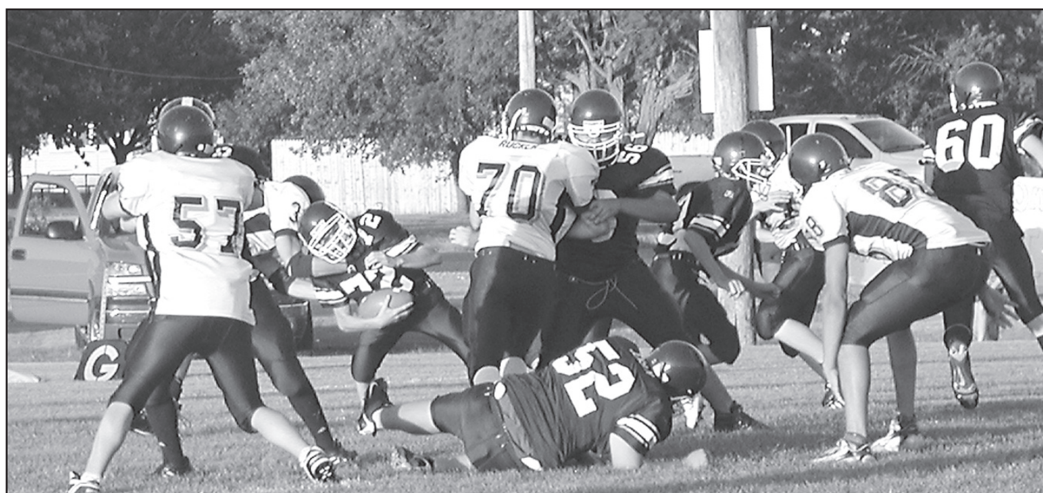
CHEYLIN FOOTBALL TEAM scrimmages. Their first game is Friday night against Wauneta/Palisade.