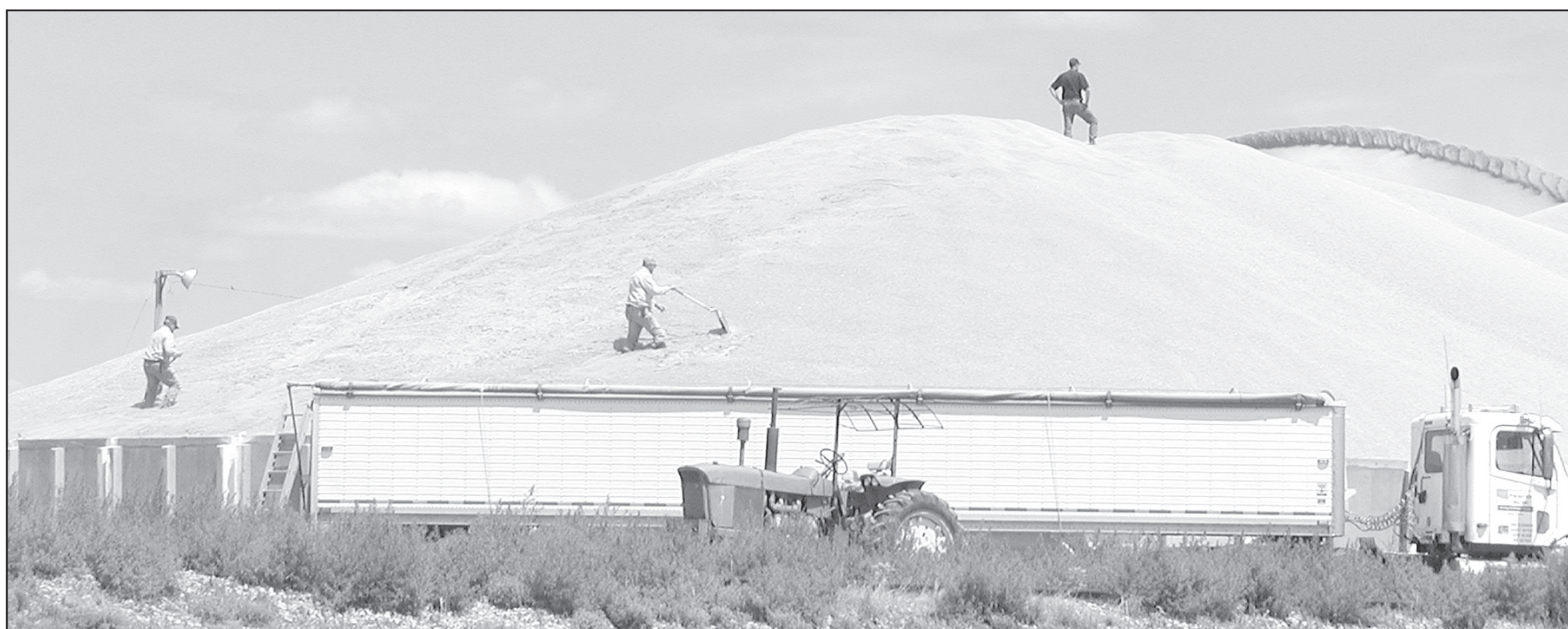
EVIDENCE OF A BOUNTIFUL harvest. Wheat from area fields is piled high in this bunker along U.S. 36, just to the north of Bird City. Harvest crews have moved to other states, but not before many loads of grain were collected.