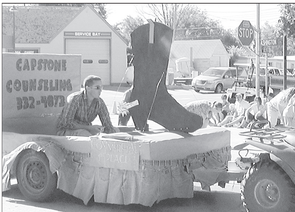
WINNER OF THE commercial division float was the Capstone Counseling entry in the Cheyenne County Fair Parade held on Saturday.