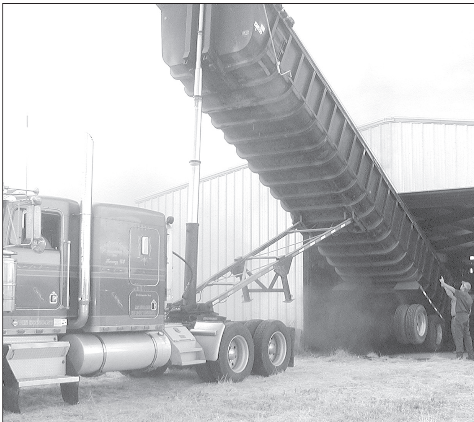
COAL ARRIVES! 25.5 tons of coal is unloaded and will power antique engines for two to three years.