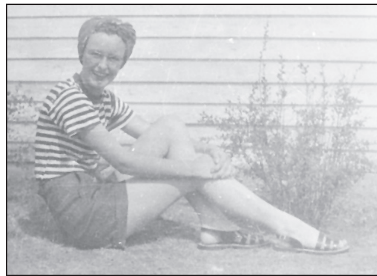
2010 Thresher Queen