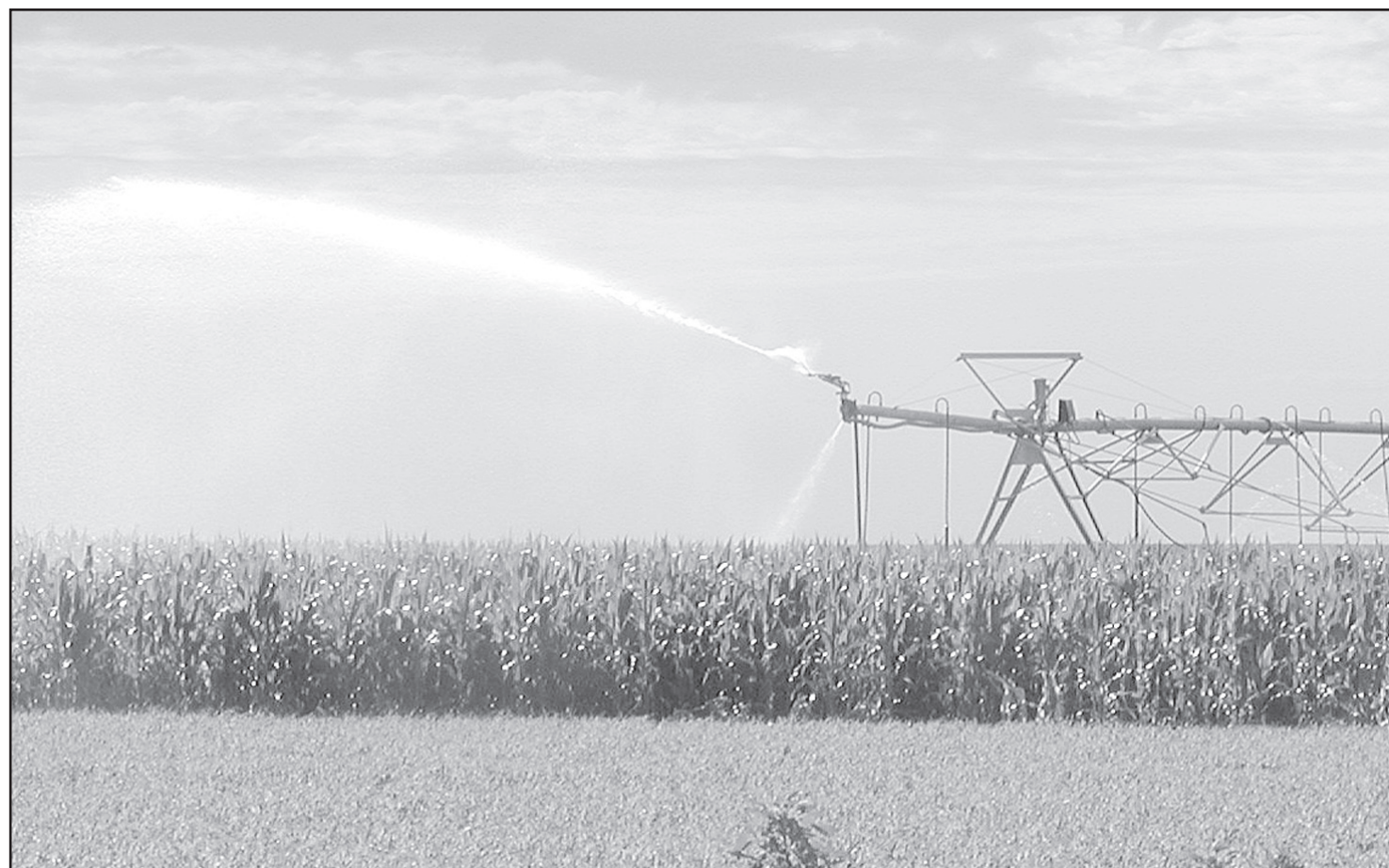
CORN FIELDS around the area are looking good and growing fast with the hot weather.