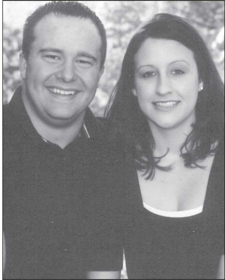
White — Crow