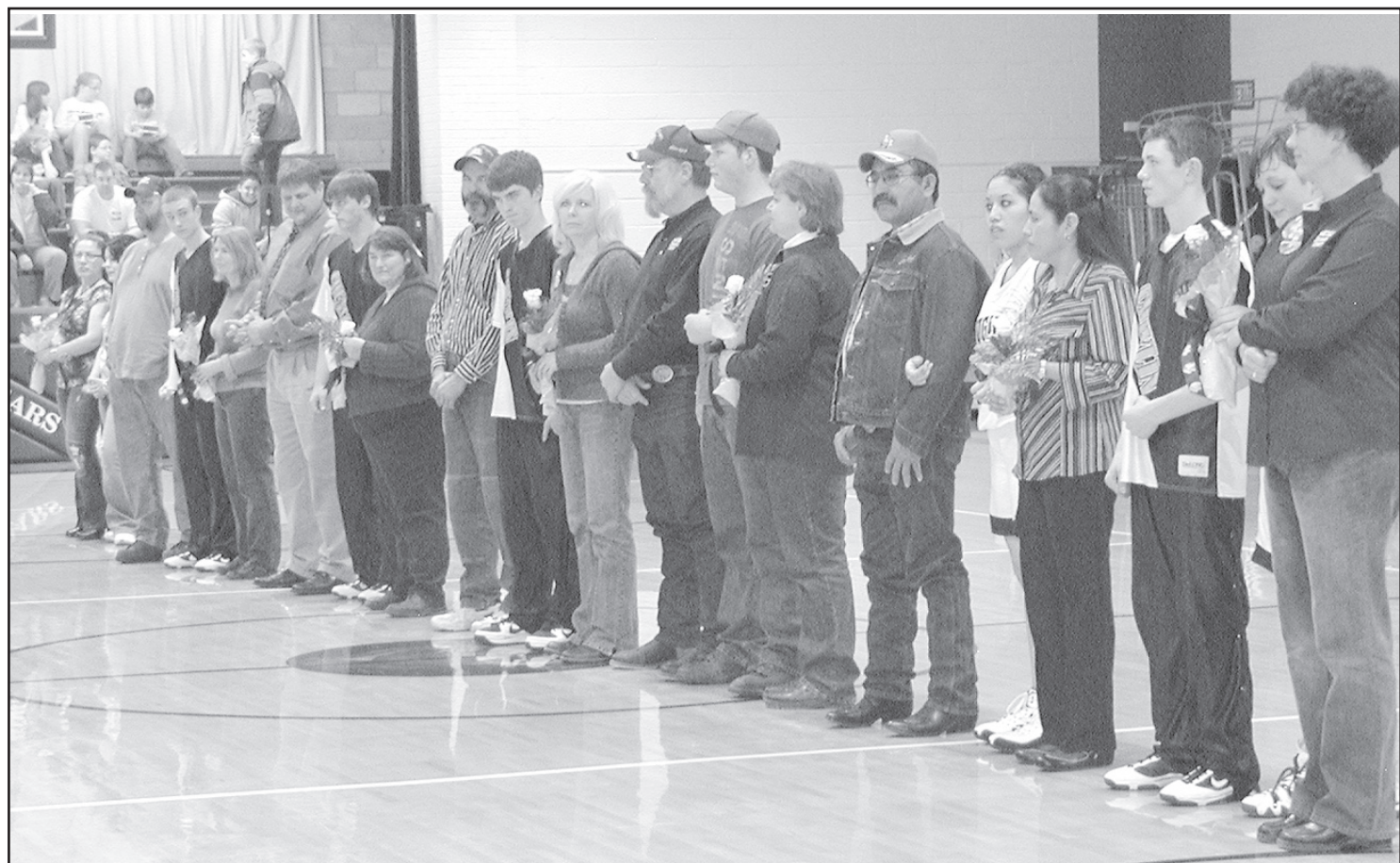
CHEYLIN SENIORS HONOR their parents at Parents Appreciation Night during a recent basketball game.

In 2006, the monument was restored with funds raised from donations.