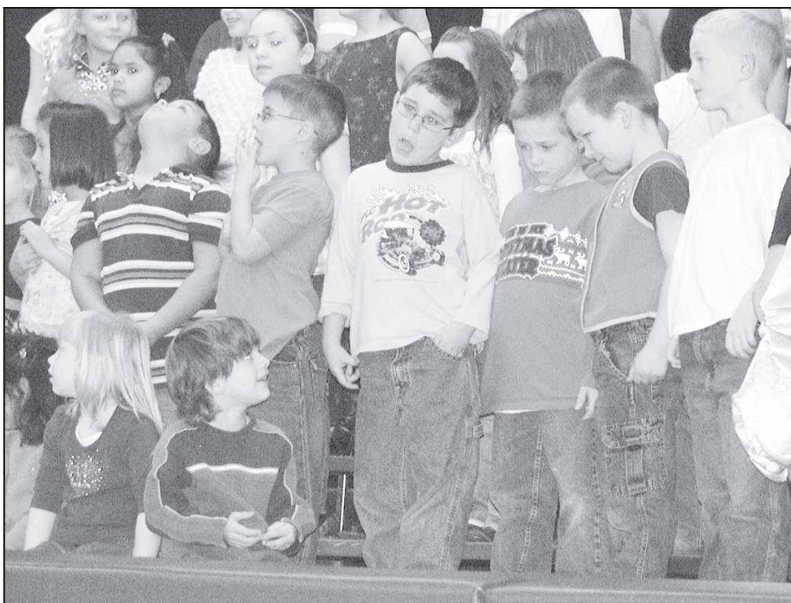
THE SECOND and third grade students take a break between songs during the Senior Day program.

The fifth and sixth grade choir sang, "Quiet Night," followed