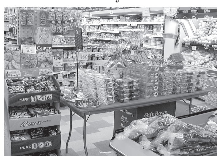
Unique Products at Fantastic Prices