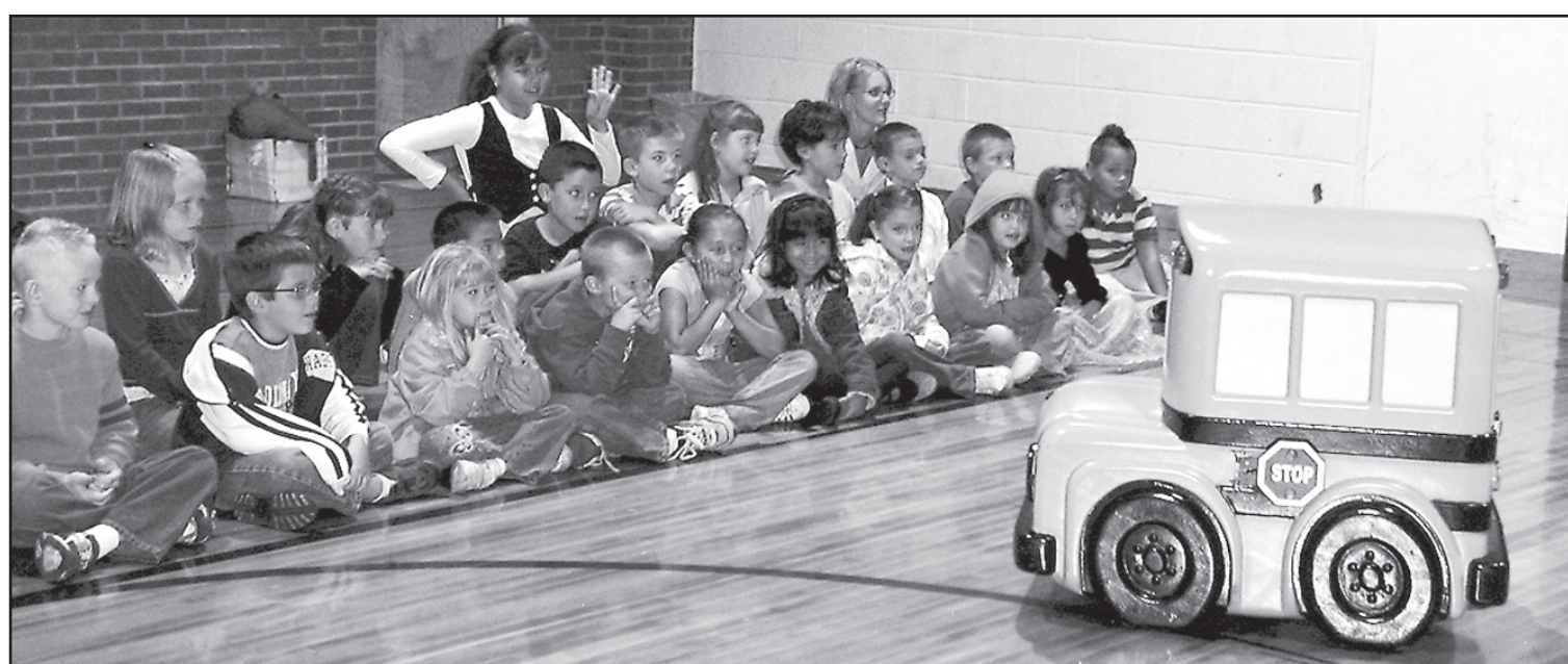
BUSTER, a remote controlled bus visited students in kindergarten through third grade.