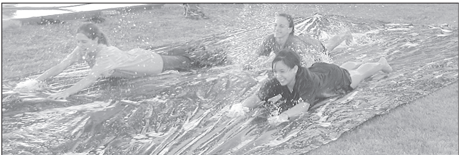
IT WAS A WET AND WILD TIME for the everyone who came to the kick-off party for Teens for Christ held at the Van Doren Park.