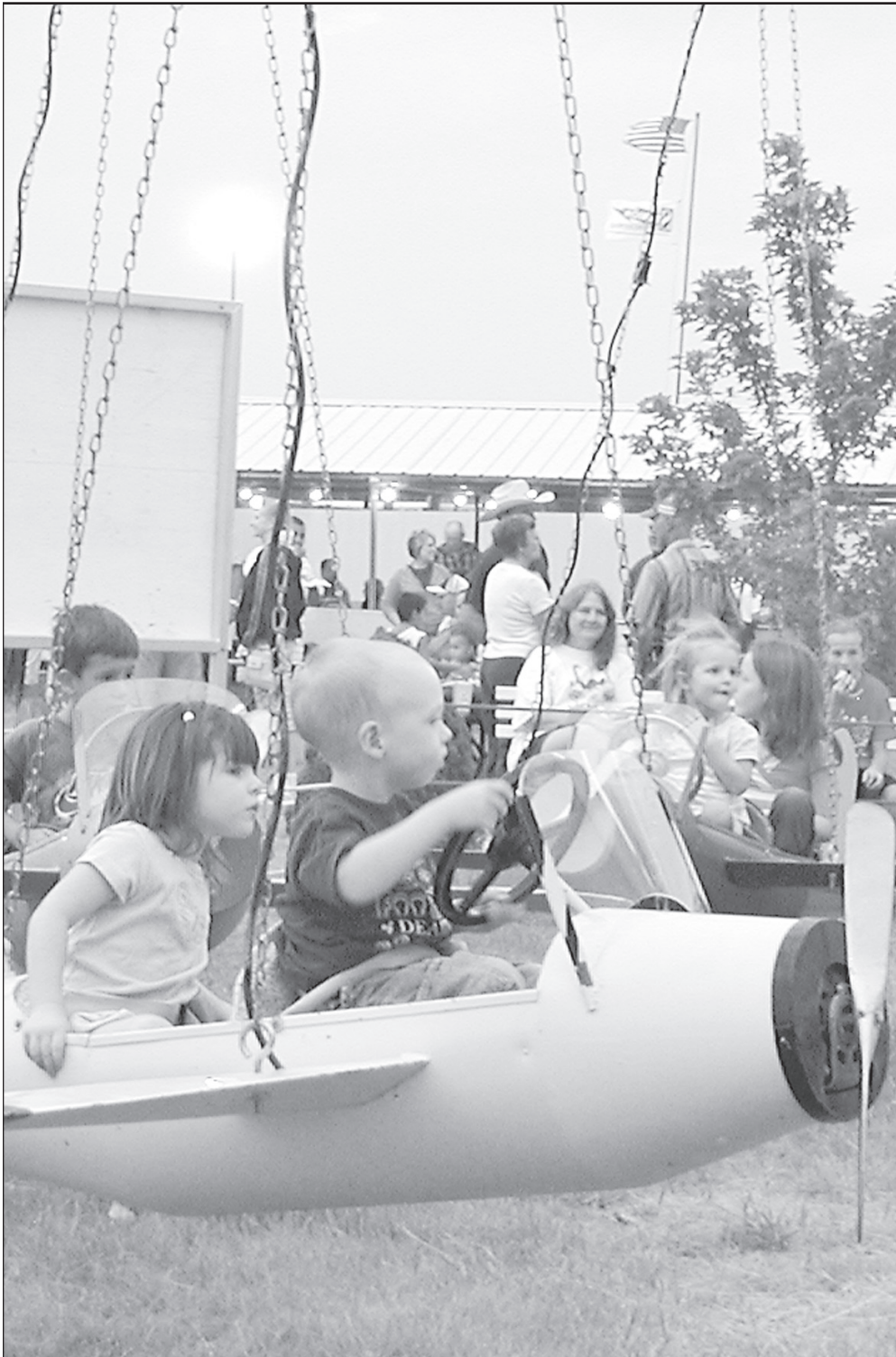
THE AIRPLANE ride is fun for the children.