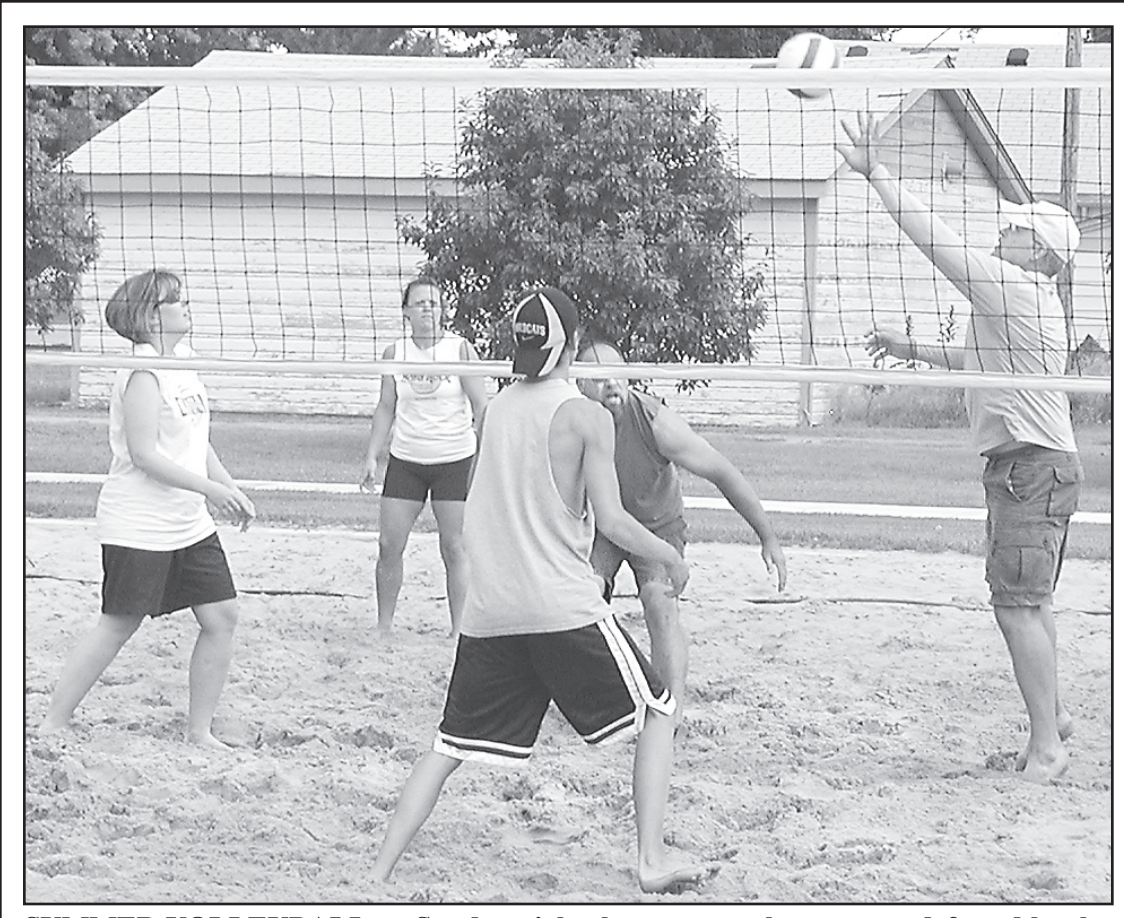
SUMMER VOLLEYBALL – Sunday night the younger players were defeated by the older group.