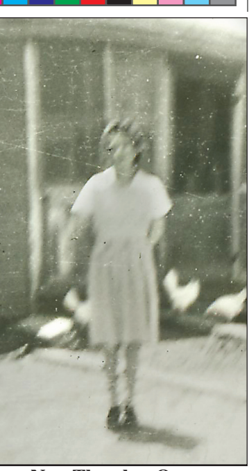
New Thresher Queen

Wright. She will crown the new queen and her doll will go on display in the case of queens at the Eggers' Building on the show grounds.