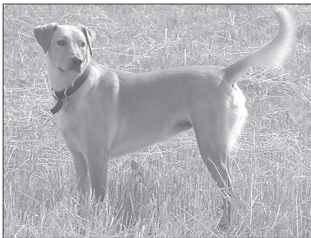
YOU MIGHT GET your pet's picture in the paper. Send in a favorite photo and information on your pet to the Bird City Times, P.O. Box 220, Bird City, KS 67731.

The next meeting of the commissioners will be held at 8 a.m. on Wednesday, July 15, at the courthouse.