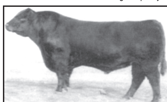
FREYS PROUD DESIGN 410P 410 is a very easy calving bull, with tons of performance. His calves ratioed very high.

2.1 55 22 98 AVERAGE EPD'S ON NEMETH BULLS Sale Bulls are in Top 3% of Breed for both Weaning and Yearling Weights.