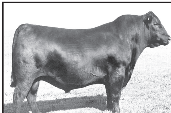
FREY'S 486R Frey's 486R is a bull that covers all the bases. His calves are small at birth that grow quickly.