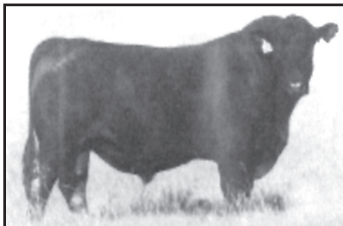
S A V 004 Hold'em 4452 Hold'em was one of the top selling in the 2005 Schaff Sale. He sires thick, easy doing cattle.

LUDELL, KANSAS LOCATION: 13 Miles Northeast of Atwood, Kansas